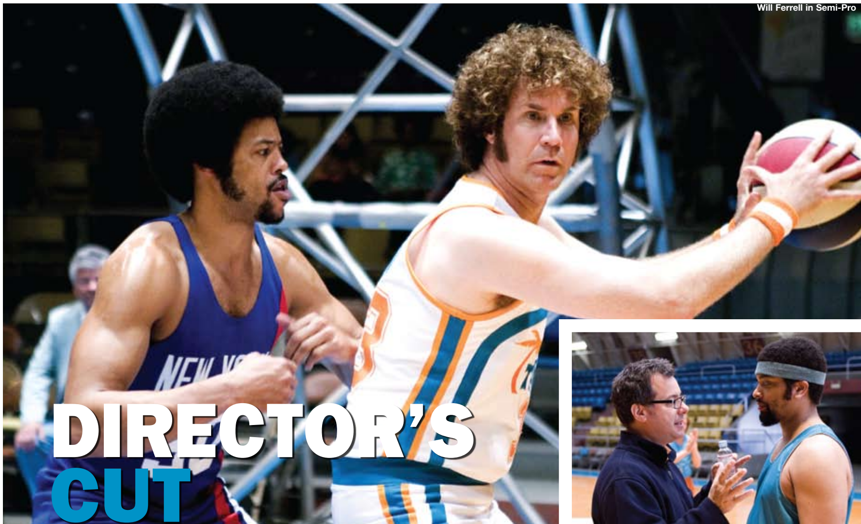
Will Ferrell in Semi-Pro